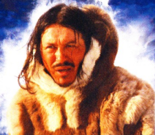
IKUMA The Hunter