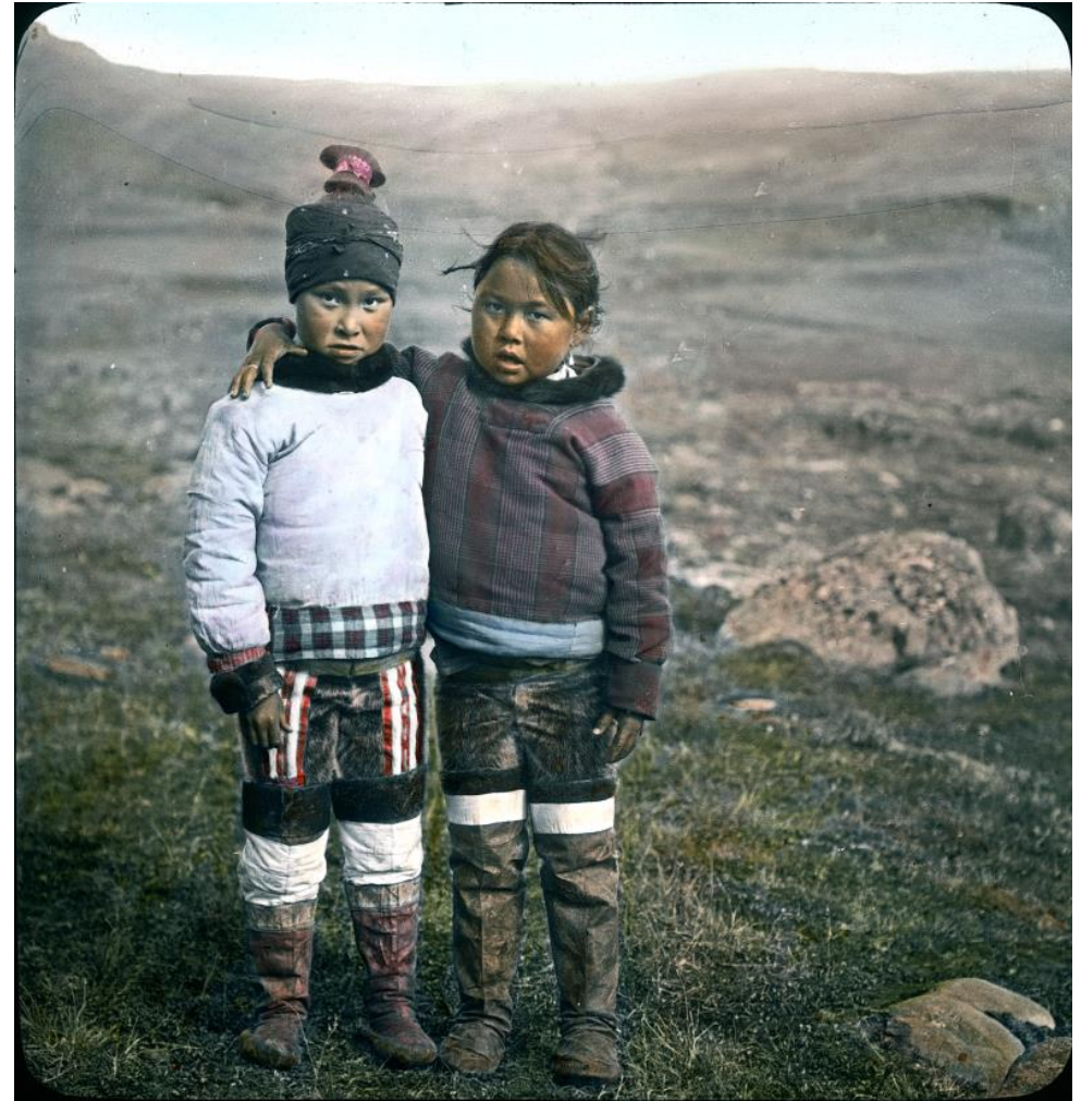
Arnold Heim, 1909, ETH Library, Image Archive